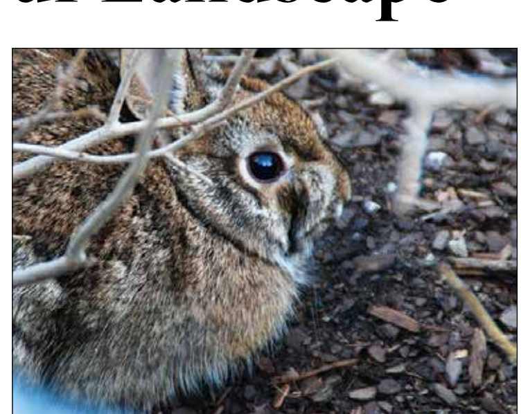
RABBITS EAT A WIDE range of plants, including flowers, vegetables, weeds, trees, and shrubs.

Evaluate and adapt your landscape design as needed and continually monitor for damage. Employ various strategies to help reduce rabbit damage while boosting your enjoyment and the garden's productivity.