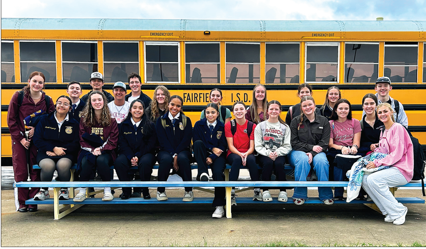
COMPETING AT THE SANDYLAND District LDE at TVCC in Athens are members of Fairfield FFA.

Future of Agriculture in the hands of our youth CELEBRATING FFA CHAPTERS & 4-H CLUBS