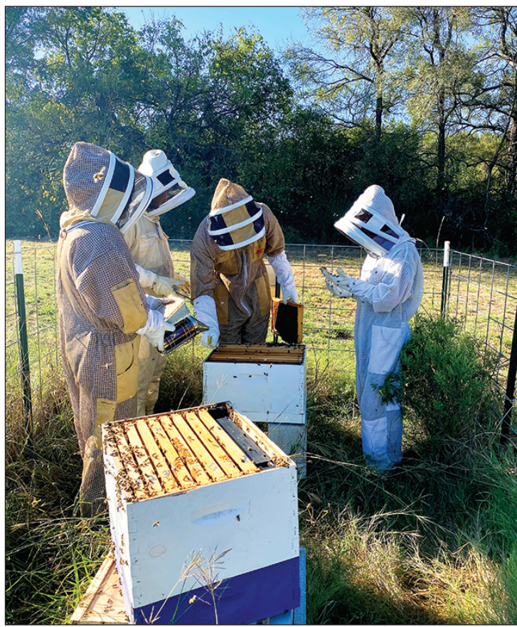
Wortham High School BEE KEEPING TEAM.