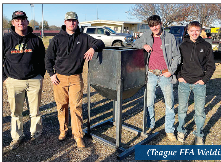
(Teague FFA Welding Teams)