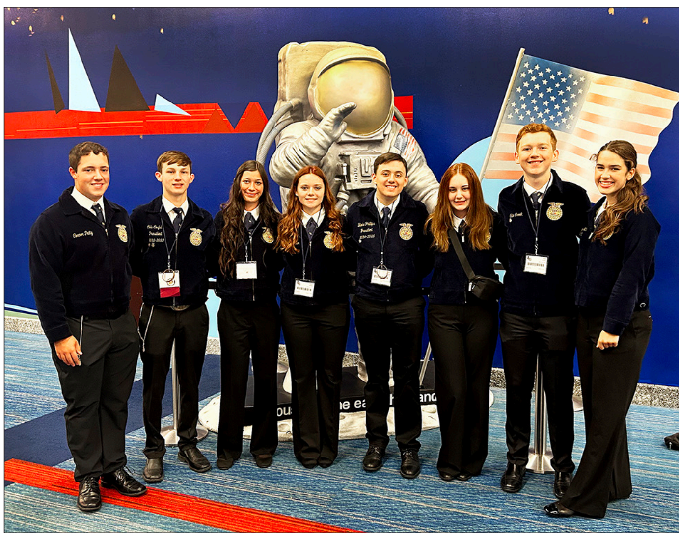
ATTENDING THE STATE CONVENTION in Houston this past summer are Fairfield FFA Officers.