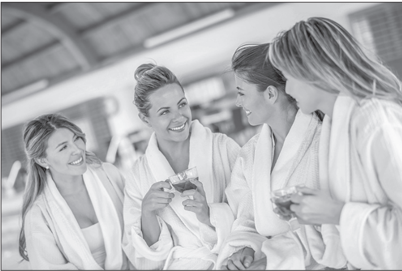
they be in the wedding party.

-- Fill balloons with confetti and messages. Ask friends and loved ones to pop ballons to reveal your request that